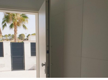
NEW BUILD VILLAS IN PINAR DE CAMPOVERDE

New Build modern residential of villas in Pinar de Campoverde