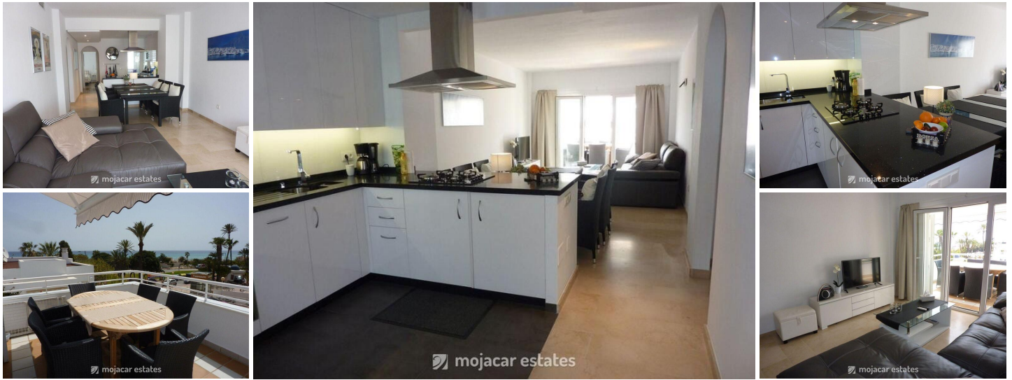
Parque Residencial Best

Fantastic top floor apartment for 6 people in residential complex in sea frontline position with superb terrace overlooking the sea and located next to Commercial Centre in Mojácar Playa, very central location with all shops and amenities within easy walking distance.