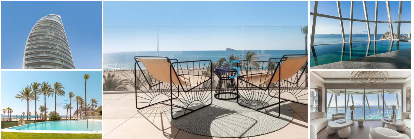
LUXURY SEAFRONT APARTMENTS IN BENIDORM

Unique New Build Luxury Key Ready residential on the Poniente beachfront, Benidorm.