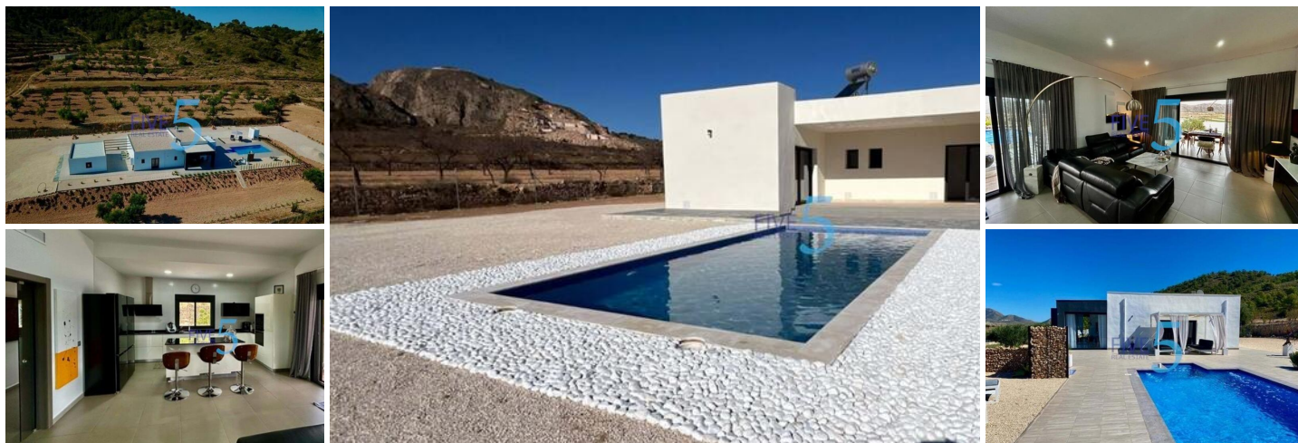
NEW BUILD VILLA IN ALBANILLA, MURCIA

New Build villa on a large plot in the municipality of Abanilla, province of Murcia.