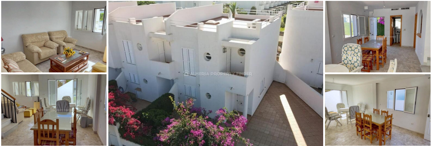
Casa Elisa - A duplex in the Mojacar Playa area. (Resale)

A lovely part furnished 3 bedroom, 1 bathroom corner duplex with a living space of 116 m 2 situated just 2 minutes walk from the beach in Urbanisation Chamberi II.