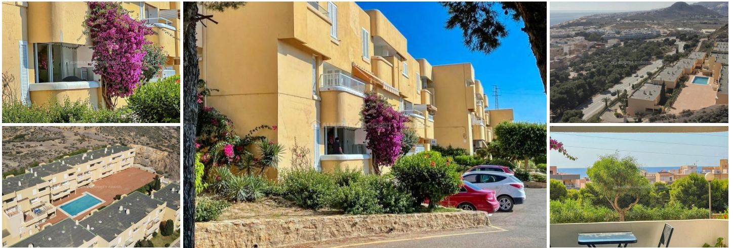
Apartamento Lila - An apartment in the Garrucha area. (Resale)

A lovely 2 bedroom ground floor apartment with a floor space of 70m 2 with sea views situated just a few minutes from the beach in Urbanisation Los Farmaceuticos.