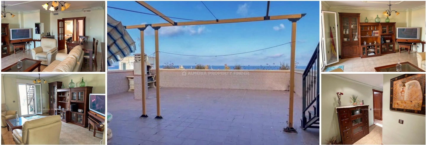
Apartamento Santino - An apartment in the Garrucha area. (Resale)

A magnificent 95 m 2 , 3 bedroom, 2 bathroom penthouse with sea views located a few steps from the beach of Garrucha. The town of Garrucha is famous for its excellent seafood restaurants serving the fresh catch of the day. The apartment is only a short stroll from the beach & seafront promenade and is situated just off the main shopping road of Garrucha with easy access to a wide range of shops, bars, restaurants, and a lively weekly market.