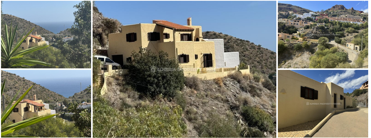
Villa Brooks II - A villa in the Mojácar area. (Resale)

La Parata: Built in 1989 this traditional 3 bed villa is located in an excellent area of the Parata. So located to maximise on the sea and mountain views. It offers east and west facing terraces positioned ideally to appreciate sun rises and sunsets. It offers spacious accommodation over 2 levels with high ceilings so the heat can rise on those hotter days. You enter into the hallway and from here you have the kitchen, separate dining room with dual aspect windows allowing for views and natural light from more than one direction, living room and a cloakroom. The living room has a working fireplace and patio doors to the terrace. All of the rooms on this level offer lovely sea views. There is a staircase leading from the living room to the lower level where you have the principal bedroom and recently updated en-suite bathroom, two further double bedrooms and a recently updated guest bathroom. The principal bedroom has a Juliette balcony off and one of the bedrooms has access to the lower terrace. This is a very nice property with a lovely light bright airy feel, with lots of good usable outside space, super sea and mountain views and a closed garage.