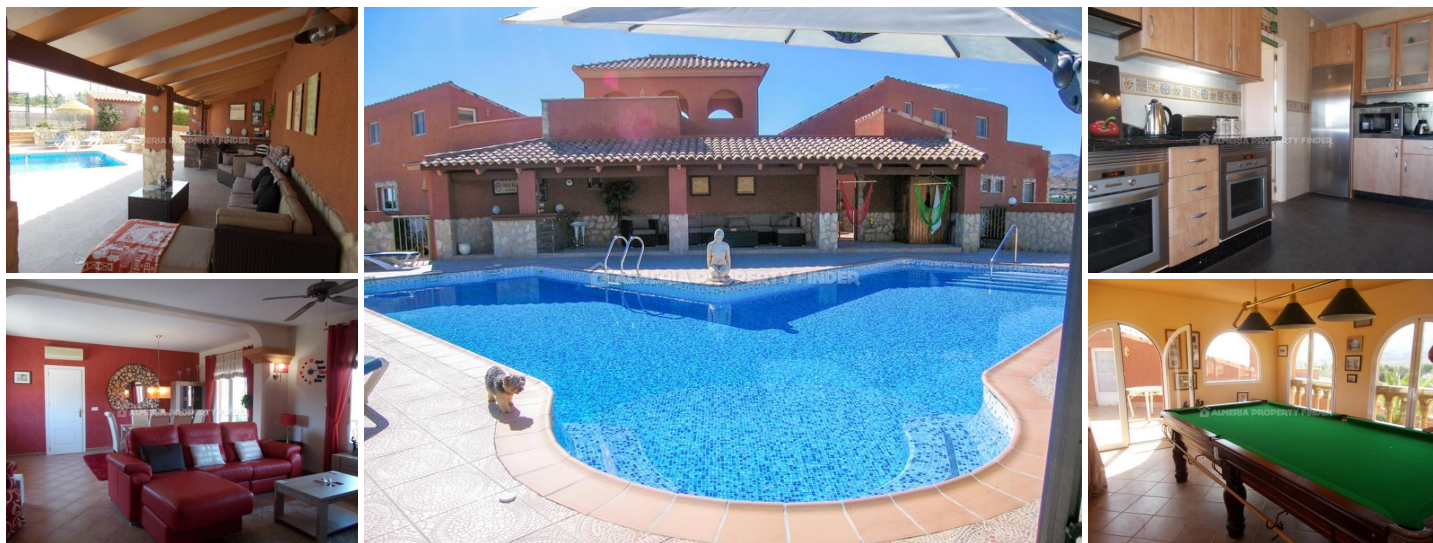
Villa Maire I - A villa in the Los Gallardos area. (Resale)

A large and impressive hacienda style property set in its own grounds of over 6,000 square metres with stunning views over open countryside to the Cabrera Mountains, within a short drive of Los Gallardos, Turre, Mojacar and with direct motorway access. The property comprises the main house and four separate independent apartments and is fully walled and/or fenced.