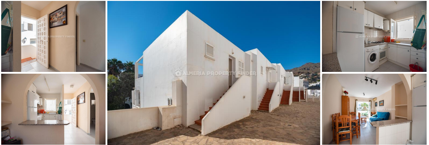
Apartment Marth I - An apartment in the Mojácar Playa area. (Resale)

Bright and breezy one bed, one bath top floor apartment in a small tranquil complex just a short distance to the beaches of Mojácar Playa and all amenities. The property also has a store room and an allocated underground parking space. The complex has a lovely communal swimming pool and the views of the mountains and sea are magnificent. Perfect as a holiday apartment with great rental potential. The property is South facing has air conditioning in the bedroom and living room and there is a nice big terrace.