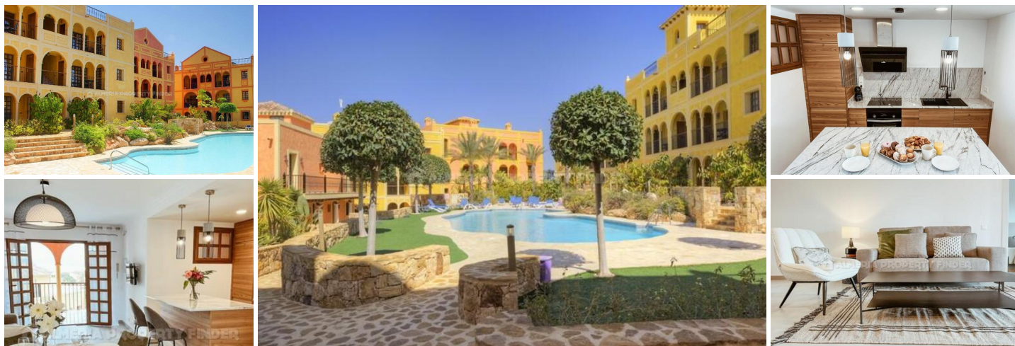
Desert Springs Sierra 146 - An apartment in the Cuevas del Almanzora area. (Newly Built)

Las Sierras III is a private residential development with a selection of NEW two and three-bedroom 'Key-Ready' Apartments set around a private swimming pool, complete with outdoor lounge space, within beautiful landscaped gardens, occupying an envious position on Desert Springs Resort.