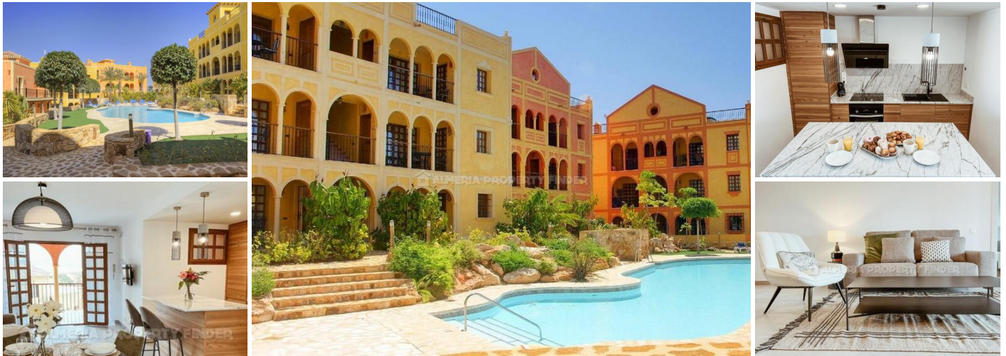
Desert Springs Sierra 246 - An apartment in the Cuevas del Almanzora area. (Newly Built)

Las Sierras III is a private residential development with a selection of NEW two and three-bedroom 'Key-Ready' Apartments set around a private swimming pool, complete with outdoor lounge space, within beautiful landscaped gardens, occupying an envious position on Desert Springs Resort.