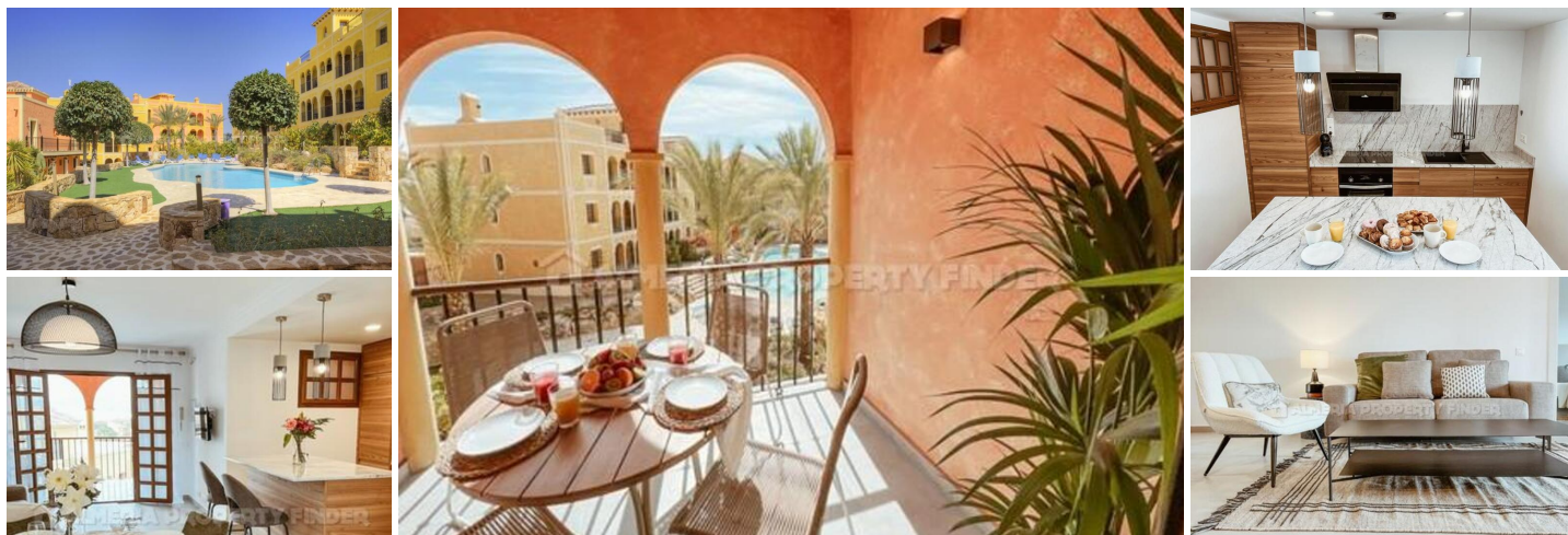
Desert Springs Sierra 247 - An apartment in the Cuevas del Almanzora area. (Newly Built)

Las Sierras III is a private residential development with a selection of NEW two and three-bedroom 'Key-Ready' Apartments set around a private swimming pool, complete with outdoor lounge space, within beautiful landscaped gardens, occupying an envious position on Desert Springs Resort.