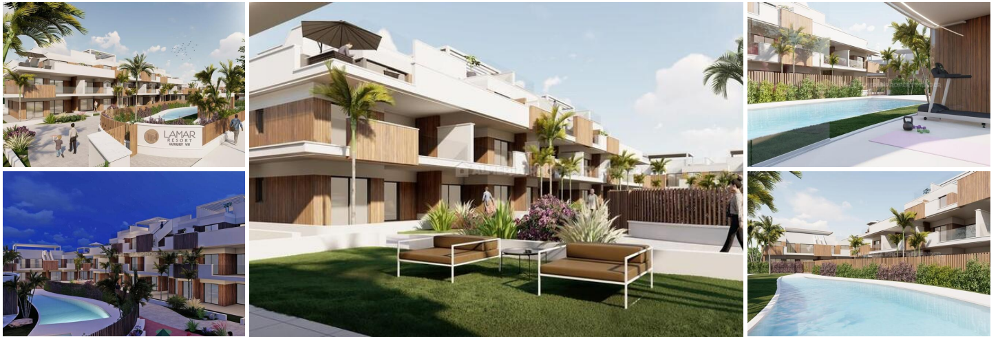
Lamar Resort Vii P30-b3 - An apartment in the Pilar de la Horadada area. (Newly Built)

LAMAR Resort Luxury VII is a luxury project of 34 apartments with 2/3 bedrooms and 2 bathrooms divided into 3 blocks with communal swimming pool, jacuzzi, gym, playground and garage with storage room. The ground floor apartments have large gardens, the first floor has terraces and the penthouses have a solarium with jacuzzi. The facades of these buildings are clad with high-quality ceramic tiles combined with a white dirt-resistant monolayer.