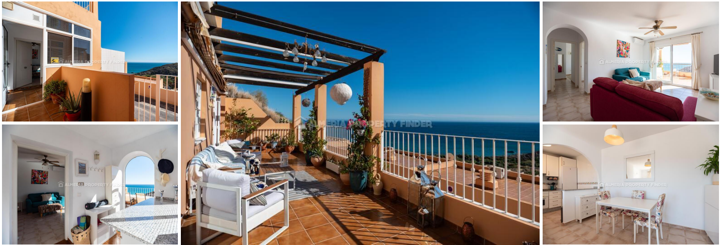
Apartment Dorathy - An apartment in the Mojácar Playa area. (Resale)

Puerto Marina II : We are pleased to offer for sale a very well presented detached end property that provides you with complete privacy and the most amazing open views of the Mediterranean. It is a first floor property, south facing and with a garage underneath so there are just a few steps that lead to the main entrance. It comprises living room / dining room that is open to the kitchen, the master bedroom with en-suite bathroom, a second bedroom and a guest bathroom. There is fantastically huge 39m 2 terrace and a closed garage.