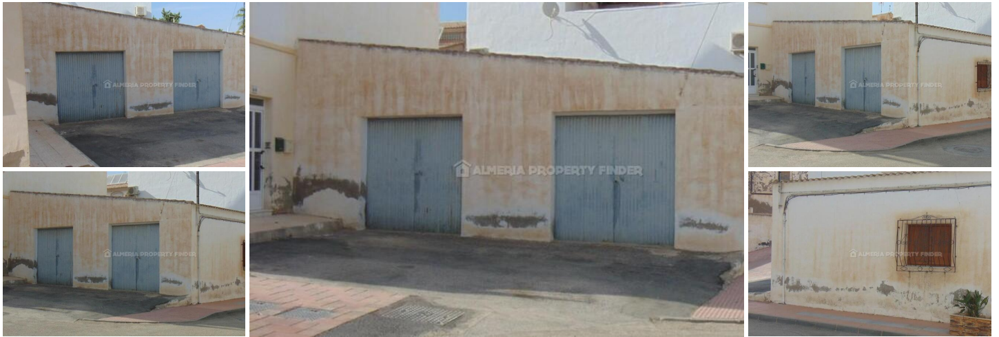
Cochera Calvario - A commercial in the Zurgena area. (Resale)

Built area 59m 2 , ground area 59m 2 , 1 floor, 2 gates, parking space for 2 cars.