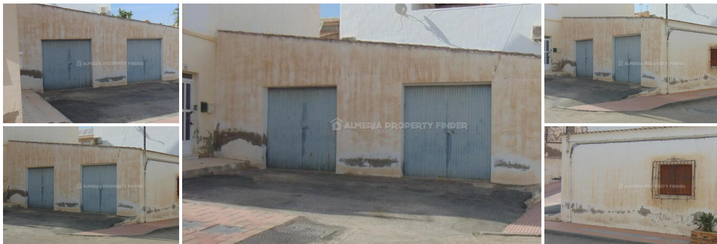
Cochera Calvario - A commercial in the Zurgena area. (Resale)

Built area 59m 2 , ground area 59m 2 , 1 floor, 2 gates, parking space for 2 cars.