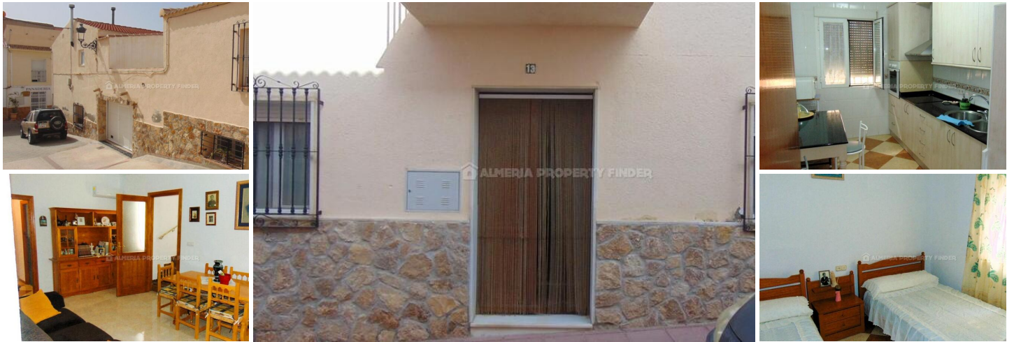
Casa San José - A village house in the Partalaoa area. (Renovated)

Village house with 264 m 2 built surface, 200 m 2 plot area, 5 bedrooms, 3 bathrooms, 3 toilets, 3 equipped kitchens, 4 living rooms, entrance hall, 2 stoves, wood fuel, fireplace, 1 garage, 1 terrace, 1 balcony, 1 storage room, air conditioning, shutters, fly screens, hot water central - electric.