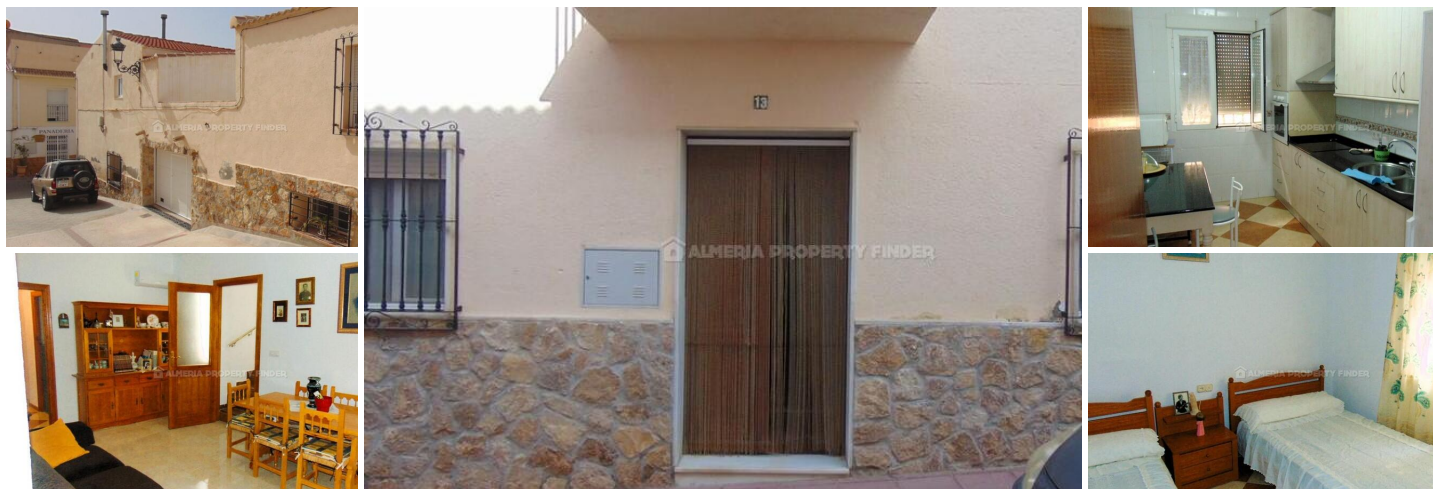
Casa San José - A village house in the Partalao area. (Renovated)

Village house with 264 m 2 built surface, 200 m 2 plot area, 5 bedrooms, 3 bathrooms, 3 toilets, 3 equipped kitchens, 4 living rooms, entrance hall, 2 stoves, wood fuel, fireplace, 1 garage, 1 terrace, 1 balcony, 1 storage room, air conditioning, shutters, fly screens, hot water central - electric.