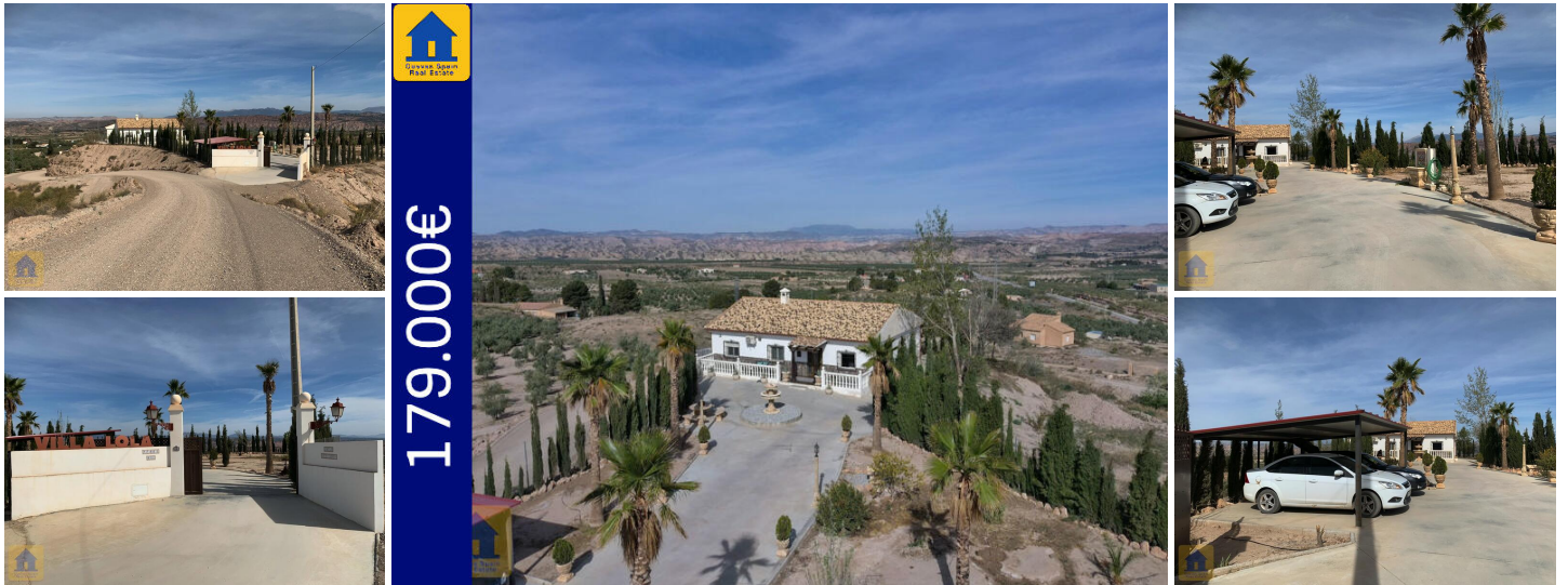
Villa Lola in Freila

This stunning property sits on a hilltop surrounded by 360° of rolling hills and mountains, with views of Lake Negratin in the distance. These hills are part of the natural Badlands that are characteristic of this region. The property feels remote yet it's just a couple of minutes drive to the motorway and 5 minutes drive to the traditional Andalusian village of Freila. The house, patio and garden are fully fenced with a privacy gate. A wide entrance driveway leads to the patio, garden areas, 2-car carport and the house. A porch runs along the front of the house. Around the back is a covered patio.