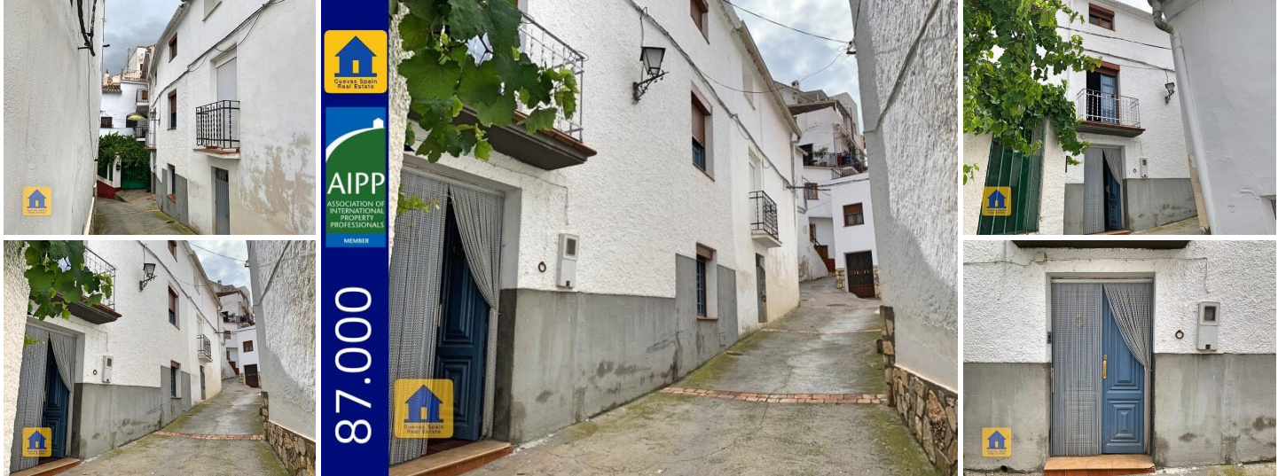
Town house loles castril

Large town house full of character in the center of the stunning village of Castril. This house was built in 1919 and is located on a narrow, winding, cobblestone street. The street has vehicle access for unloading only. The house is on 3 storeys with wide staircases, a large landing on each floor, and a courtyard at the back of the property.