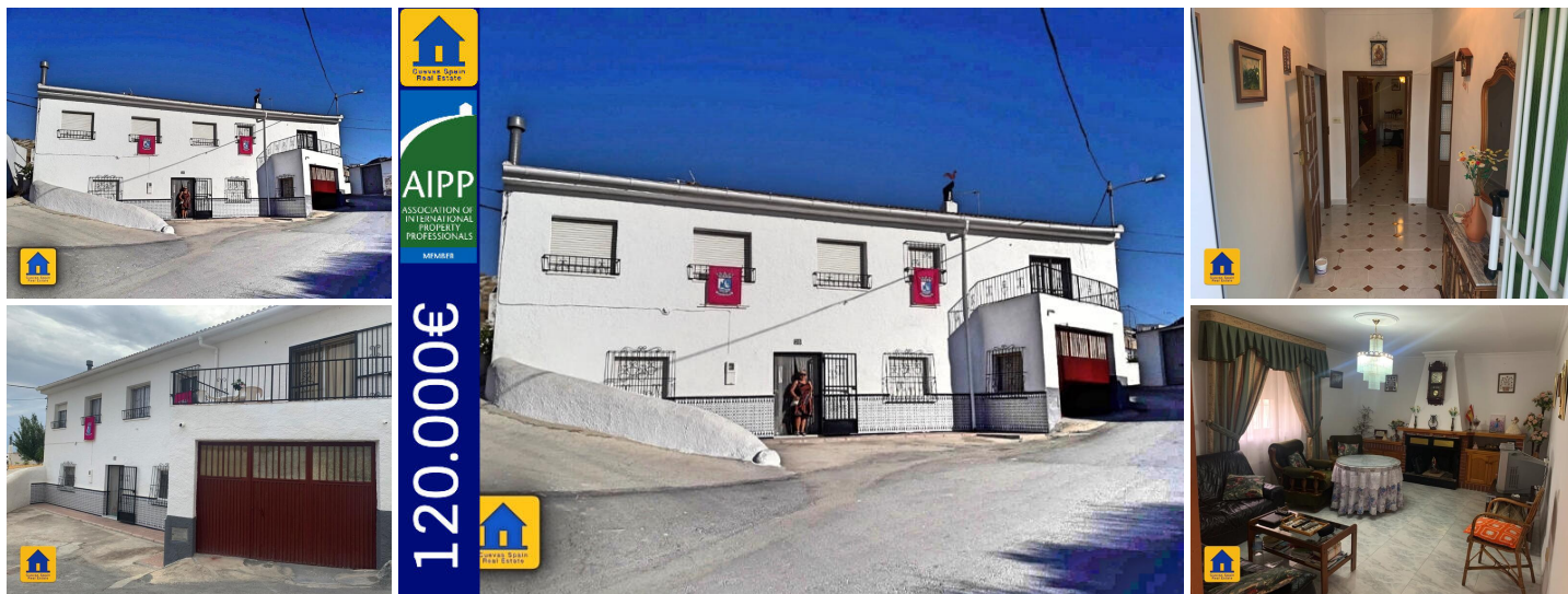
Castillejar cave house marcelino

Large cave house in the pretty village of Castillejar. This is a two-storey house with a vast cave at the back. There are 6 bedrooms and 2 bathrooms and it is sold nicely furnished. The entire property is in an impeccable state and ready to be lived in. The front house has a garage that is currently used as a utility room. There is a possibility of acquiring another garage just across the street. The cave part is a vast, deep, high quality cave. The house part has a terrace accessible from the first floor with great views facing east over the badlands. There is a separate side entrance leading to the second floor that can be handy should you wish to use the 2nd floor as a holiday let or long-term rental. Easy access, room for parking. The property is located near the village center and all amenities are less than a 10 minute walk.