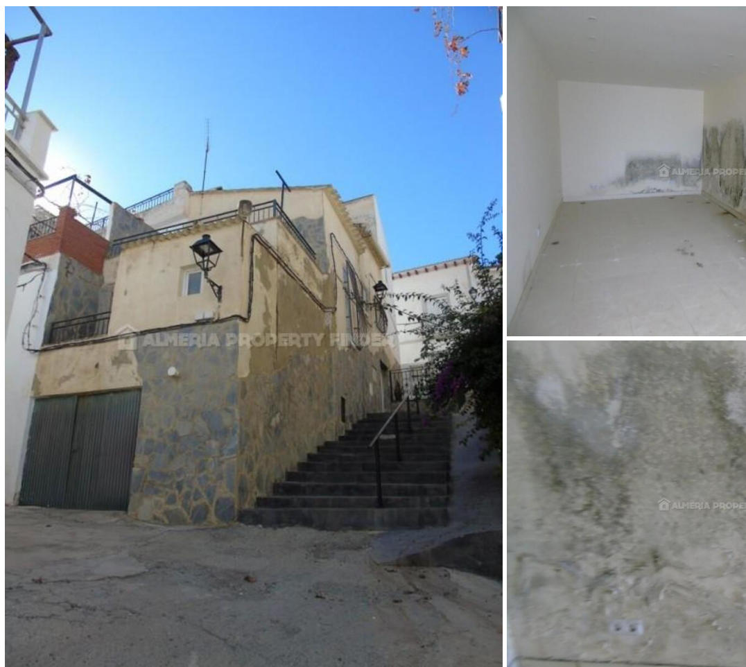
Casa la Mina - A village house in the Purchena area. (Partially Reformed)