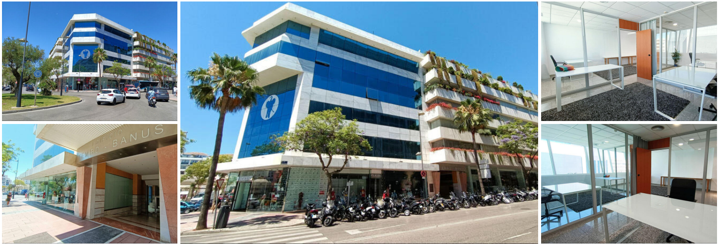
TOP FLOOR OFFICE IN EMBLEMATIC TEMBO BANÚS BUILDING IN PUERTO BANÚS

Access 24/7, public underground parking, lift to all levels, Concierge.