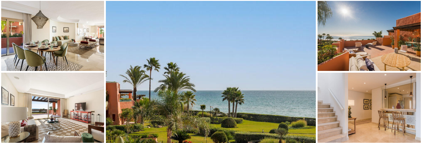
Penthouse ARENA - Marbella EAST (Los Monteros)