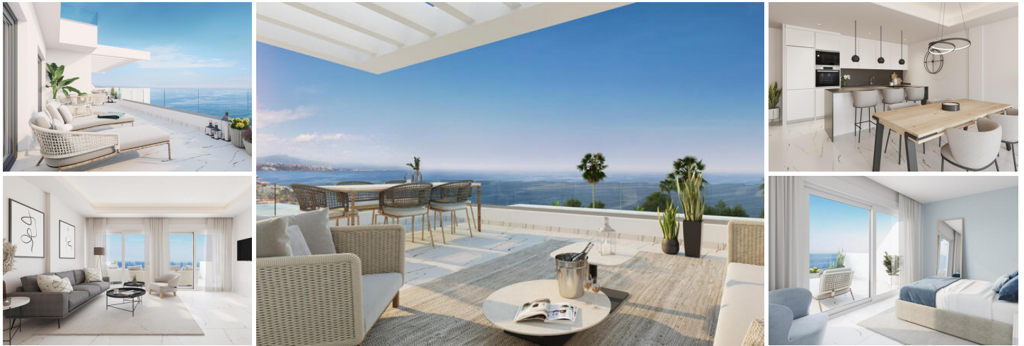
PENTHOUSE ATICA – Stunning sea view, 250 m from the beach – CASARES COSTA, Costa del Sol

Located between LA DUQUESA and ESTEPONA – New construction with golf, sea, shops, and schools nearby and with elevators, infinity pool, gardens, gym and a social club.