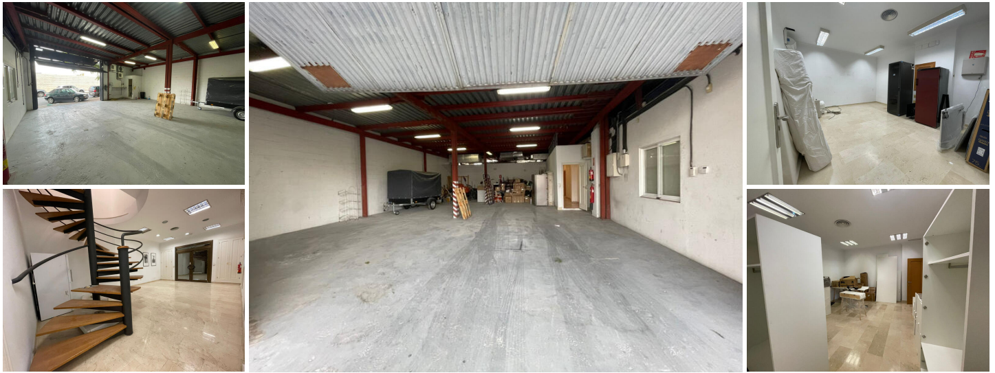
Warehouse, Marbella, Costa del Sol.

Setting : Beachfront, Town, Commercial Area, Beachside, Close To Golf, Close To Port, Close To Shops, Close To Sea, Close To Schools, Close To Marina.