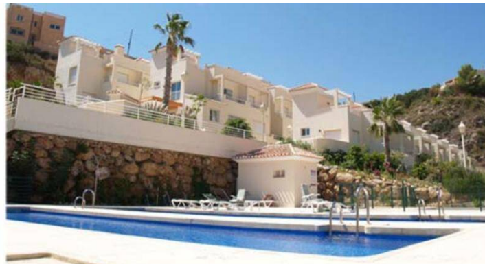
RESIDENCIAL LA ATALAYA 2-5 HABITACIONES ADOSADAS CON GARAJES, ZONAS COMUNES Y PISCINAS COMUNITARIAS PROMOTORA: EL PINAR DE BEDAR S.A.