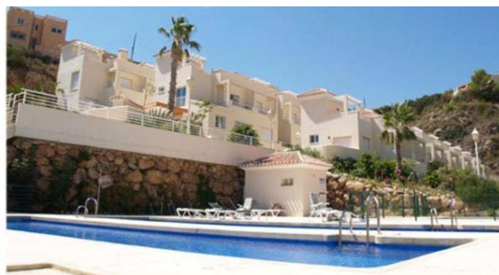
RESIDENCIAL LA ATALAYA 23 BROWN DAS ADOSADAS CON GARAJES, ZONAS COMUNES Y PISCINAS COMUNITARIAS PROMOTORA: EL PINAR DE BEDAR, S.A.