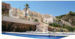
RESIDENCIAL LA ATALAYA