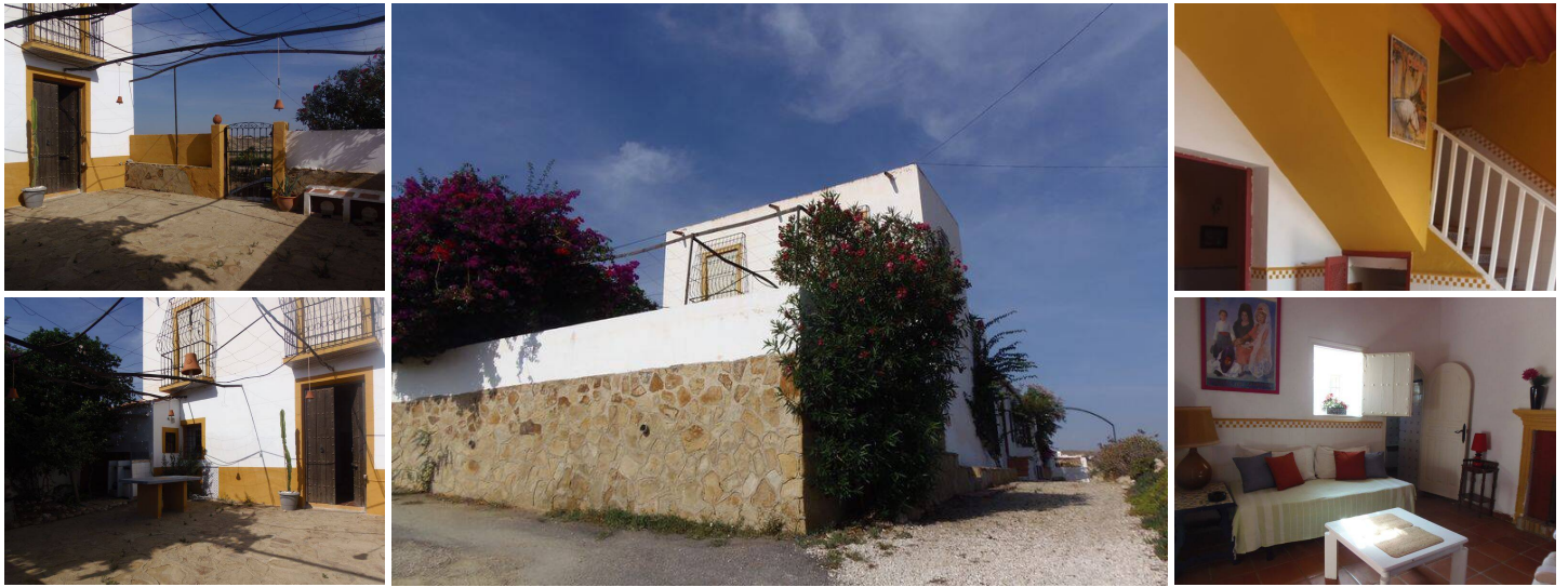
Cortijo with 3 bedrooms for sale in Mojácar.

Beautiful farmhouse in the town of Mojácar with a special charm, the house is perfectly preserved consists of two floors that are distributed as follows; ground floor super hall with access to the upper floor, large living room with fireplace, bathroom, dining room and fully equipped kitchen. On the upper floor we can find three double bedrooms, bathroom and terrace with stunning views of Mojácar Pueblo, valley and the Sierra Cabrera mountains.