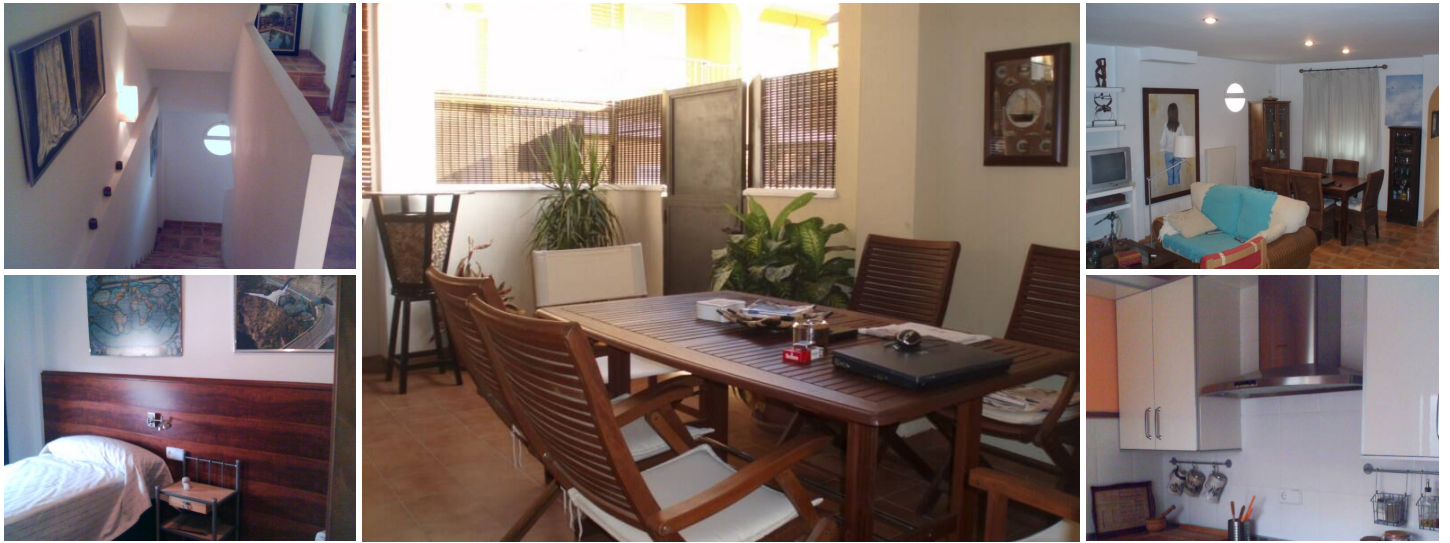
3 bedroom duplex for sale in Palomares, Almería.

Beautiful duplex located less than two kilometers from the beach. The entrance to the house is perfectly located within a small Urbanization. It has 3 bedrooms and 2 bathrooms, fully furnished kitchen. On the upper floor there are the bedrooms with built-in wardrobe and terrace. In the upper part of the house there is a solarium with great views of the sea. The house has a garage of more than 100 m2 and communal pool