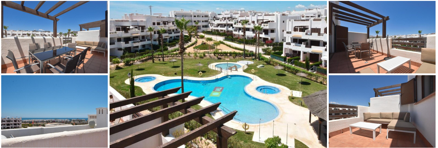
Luxury penthouse in the area of Mar de Pulpí!

Very close to the beach in a very sought-after urbanization of San Juan de los Terreros. Grupo Platinum presents this beautiful penthouse with 2 bedrooms, 1 bathroom, and parking space. A property very well used in space with a sunny terrace where you can appreciate the stunning views of the urbanization and communal pool. Fully furnished and equipped to the highest quality standards; a living dining room with access to the terrace and an open plan kitchen with all the appliances you could need! One bedroom with twin beds, excellent lighting, built-in wardrobe, and another bedroom; the master with double bed, and a fitted wardrobe. There is also a bathroom with shower and separate toilet to be used as 2 bathrooms in 1. Going up the interior stairs we find a perfect private solarium with sea and mountain views to contemplate the beautiful sunrises and sunsets. The property is sold furnished, ready to move into, and has ducted air conditioning with hot and cold pumps. Call us to visit today at +34 9504466112.