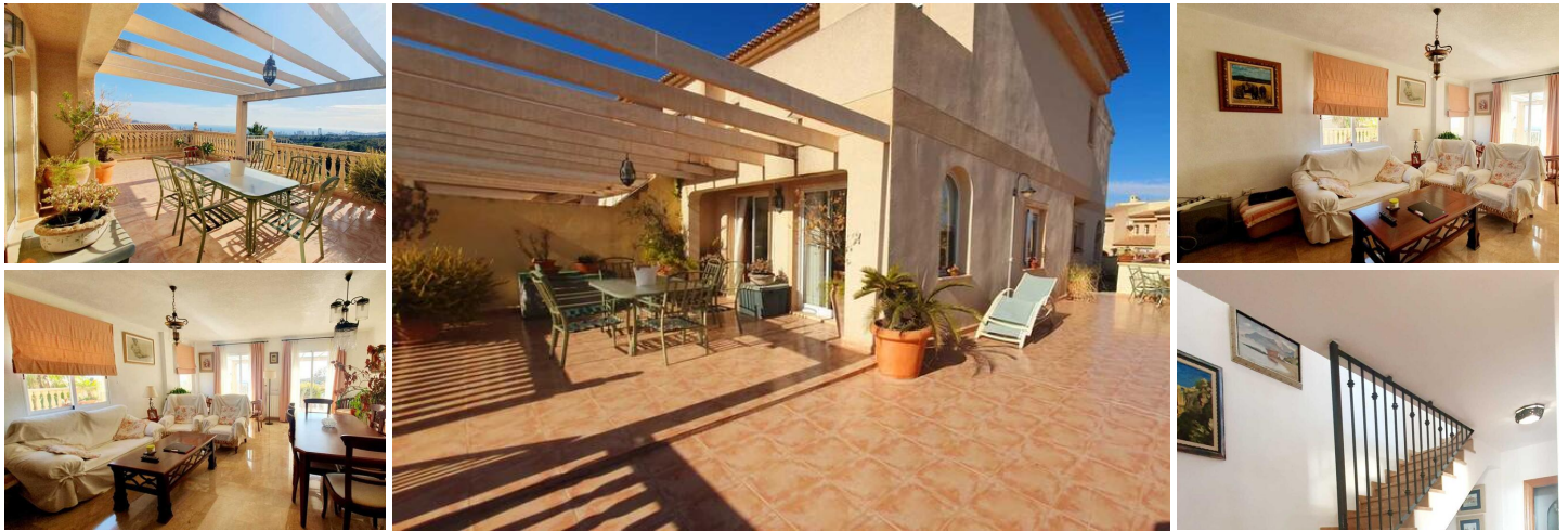
SEMI DETACHED VILLA IN LA NUCUA

Semi-detached villa in La Nucia with stunning views to the sea and Benidorm.