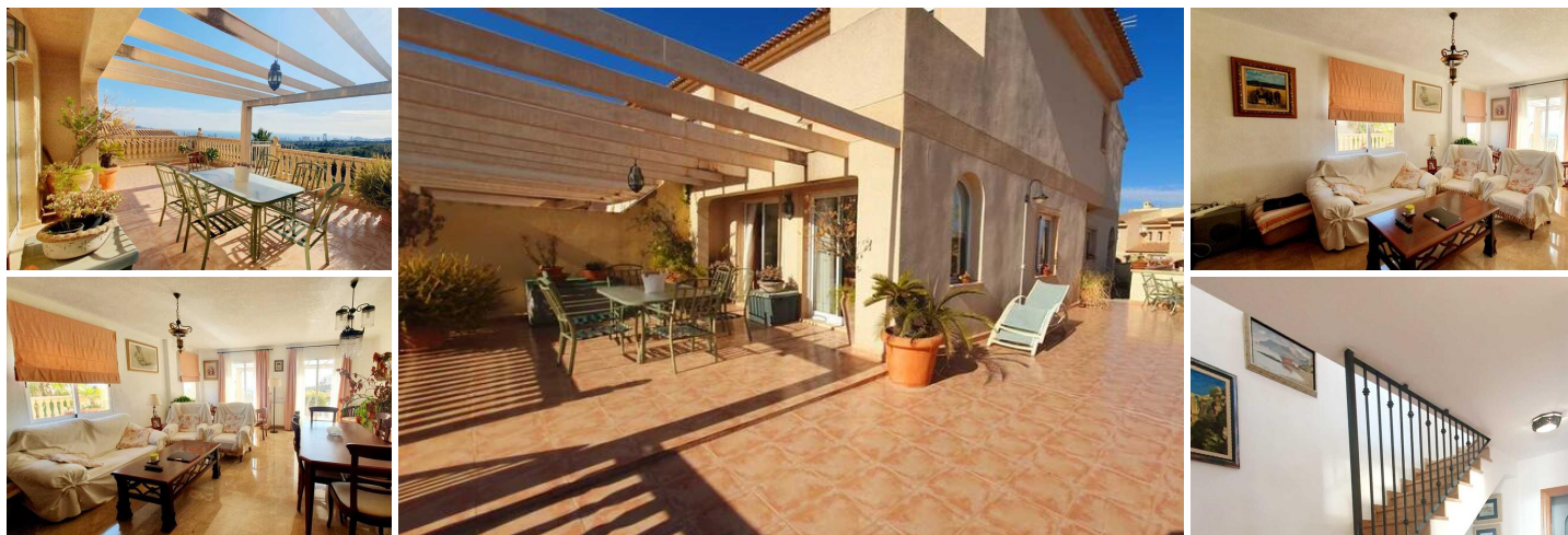
SEMI DETACHED VILLA IN LA NUCUA

Semi-detached villa in La Nucia with stunning views to the sea and Benidorm.