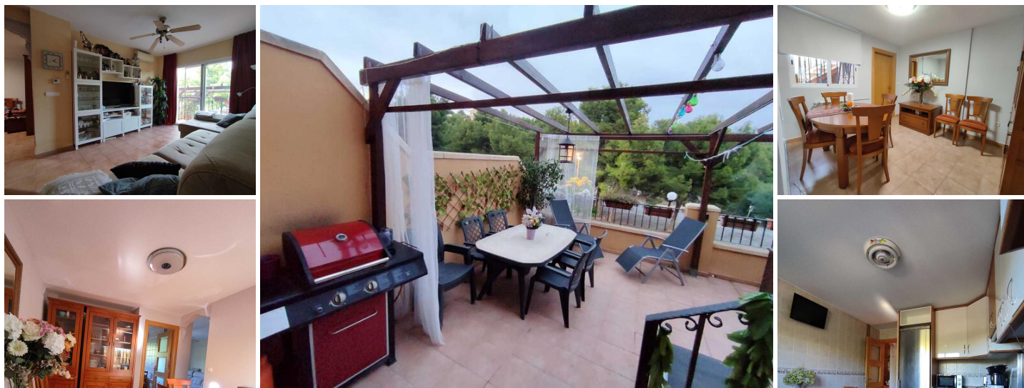
BEAUTIFUL TOWNHOUSE IN LA NUCIA

Townhouse situated in La Nucia, in a good location, with good access to main road, close to family parks, MasyMas supermarket, public transport and school bus stop, 8 minutes drive to Benidorm, 5 minutes drive to Alfaz del Pi and 5 minutes drive to La Nucia.