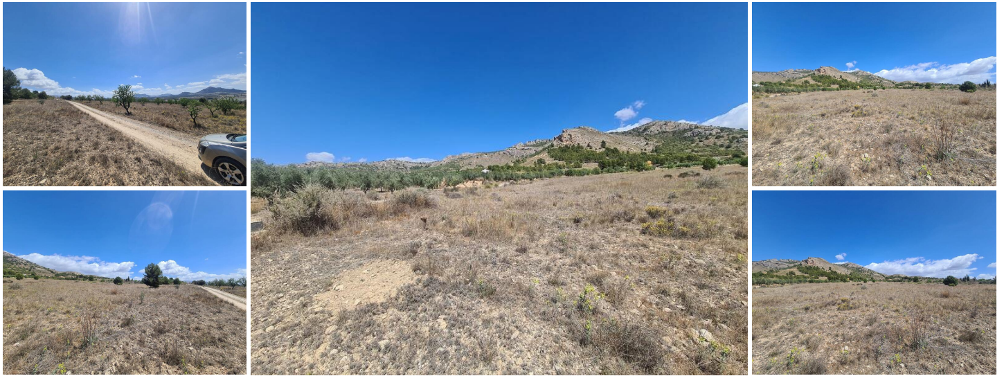
16,200m2 of land in Sax - Santa Eulalia. Awaiting photos

We are proud to offer this plot of land with good access to the motorway system, but with great mountain views. Water and electricity is close, but not on the land, so the buyer would be responsible for these, or, would be ideal for an off grid property. There is a petrol station with shop, and two very good restaurants withing walking distance.