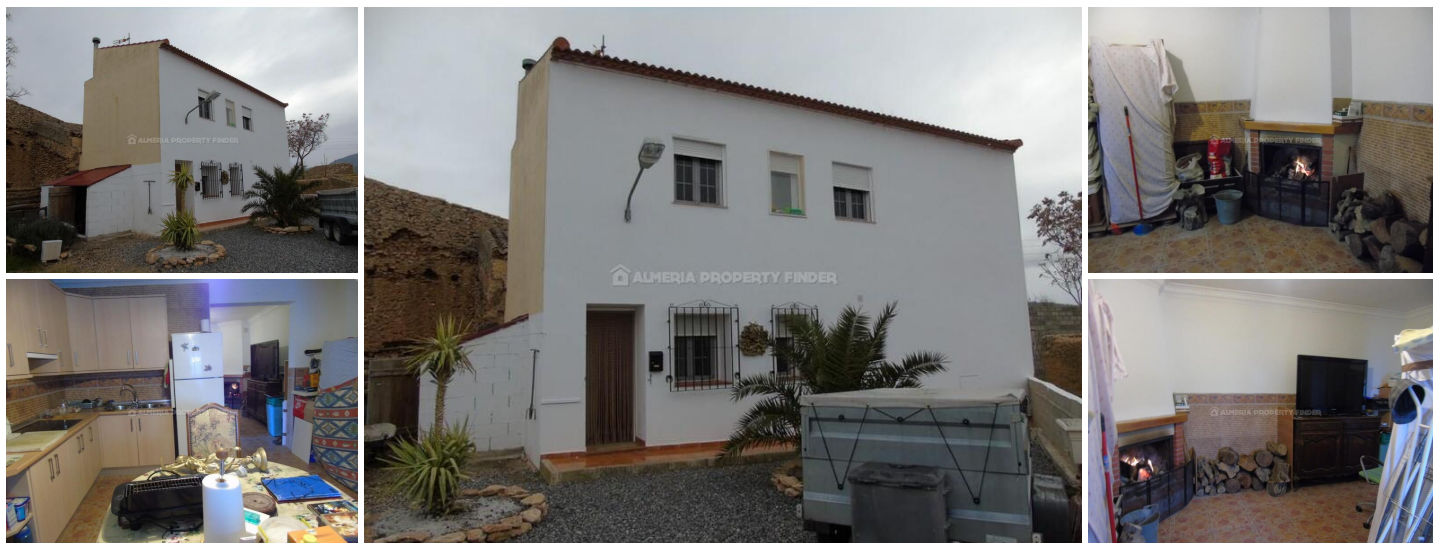
Cortijo Adela - A country house in the Oria area. (Resale)

A great two storey 3 bedroom, 2 bathroom country house with a build of 105m 2 situated in a very small neighborhood with a few other houses 10 minutes away from the traditional Spanish town of Oria which offers all amenities including supermarkets, bars, restaurants, banks, bakery, butcher, 24 hour medical facilities, pharmacy, a petrol station, ironmongers and a weekly market every Sunday.