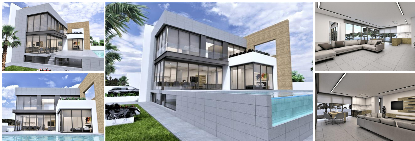
LUXURY NEW BUILD VILLA NEAR LA ZENIA BEACH

New Build villa with sea views in the beautiful area of "La Zenia".