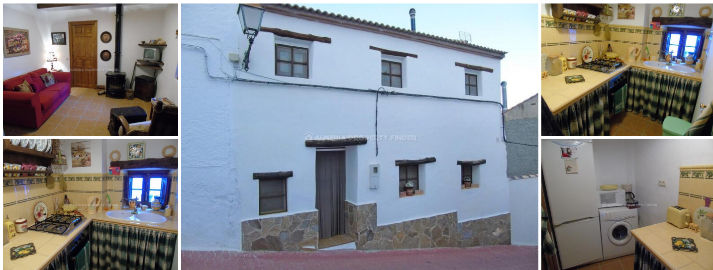
Casa Camilo - A town house in the Albánchez area. (Renovated)