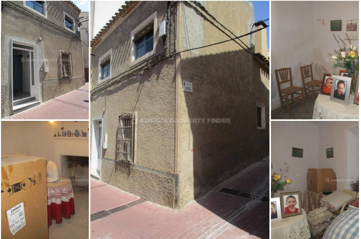
Casa del Peluquero - A town house in the Oria area. (Habitable)

Three bedroom town house for sale in Almeria Province, situated in the traditional town of Oria which offers all amenities. The property is habitable to a basic standard but in need of renovation throughout.