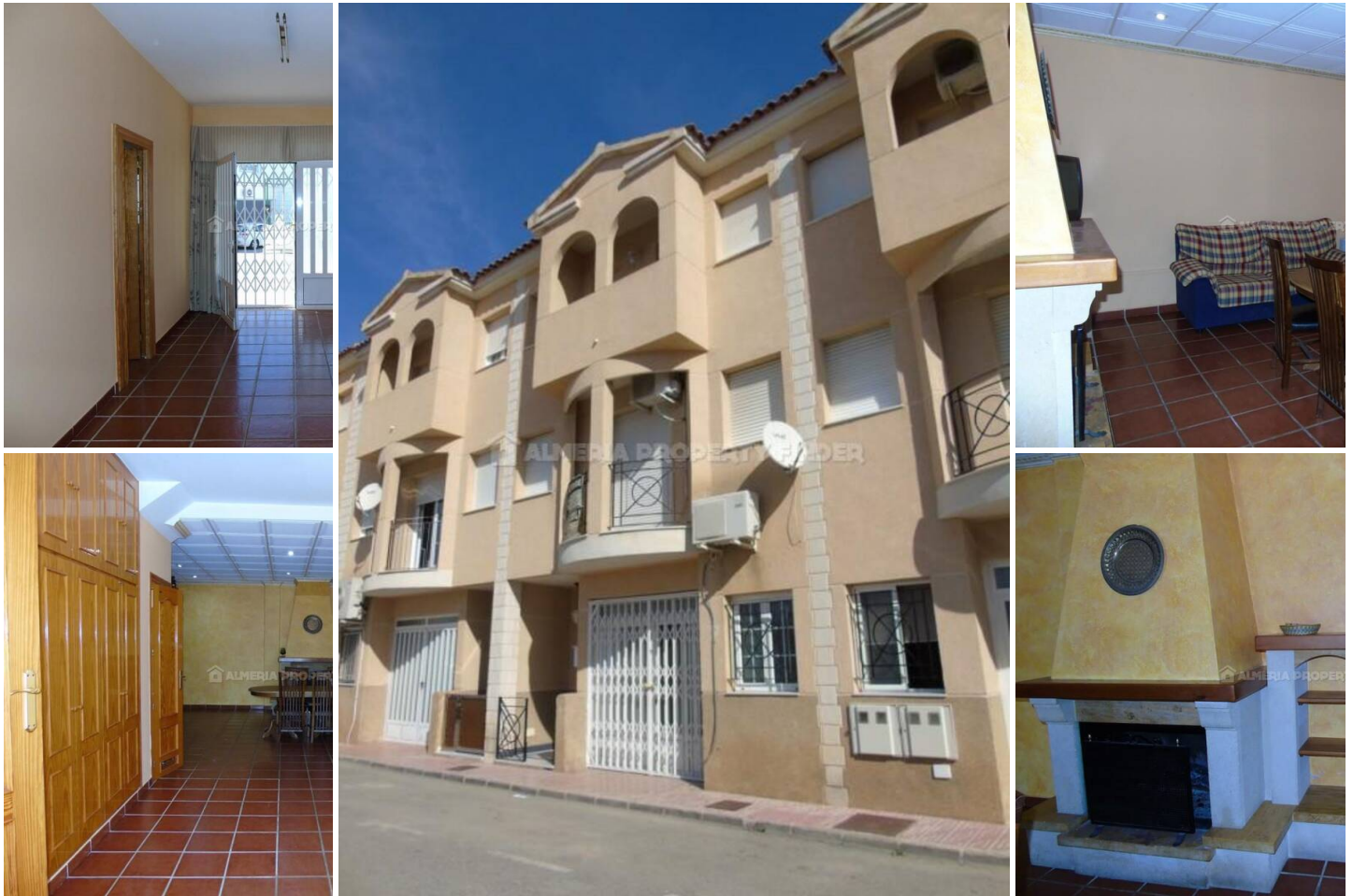
Casa Poeta - A town house in the Albox area. (Resale)

Modern three storey 4/5 bedroom town house situated in a quiet cul-de-sac with street parking in the popular town of Albox. The house is situated within walking distance of amenities including shops, supermarkets, cafes, tapas bars, restaurants, schools, sports facilities and two weekly markets.