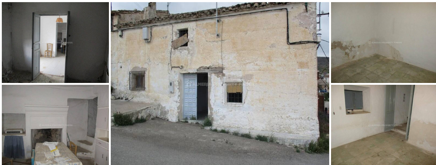
Casa San Lucas - A town house in the Oria area. (For Renovation)

Two storey 3+ bedroom town house for renovation, situated in the traditional town of Oria which offers a range of amenities including tapas bars, restaurants, supermarkets, bakery, butchers, banks, medical centre, and pharmacy. There is also an outdoor municipal swimming pool which is open during the summer months, and a small market every Sunday morning. Oria is just under an hour from the coast, and around 1 hour 20 minutes from Almeria airport.