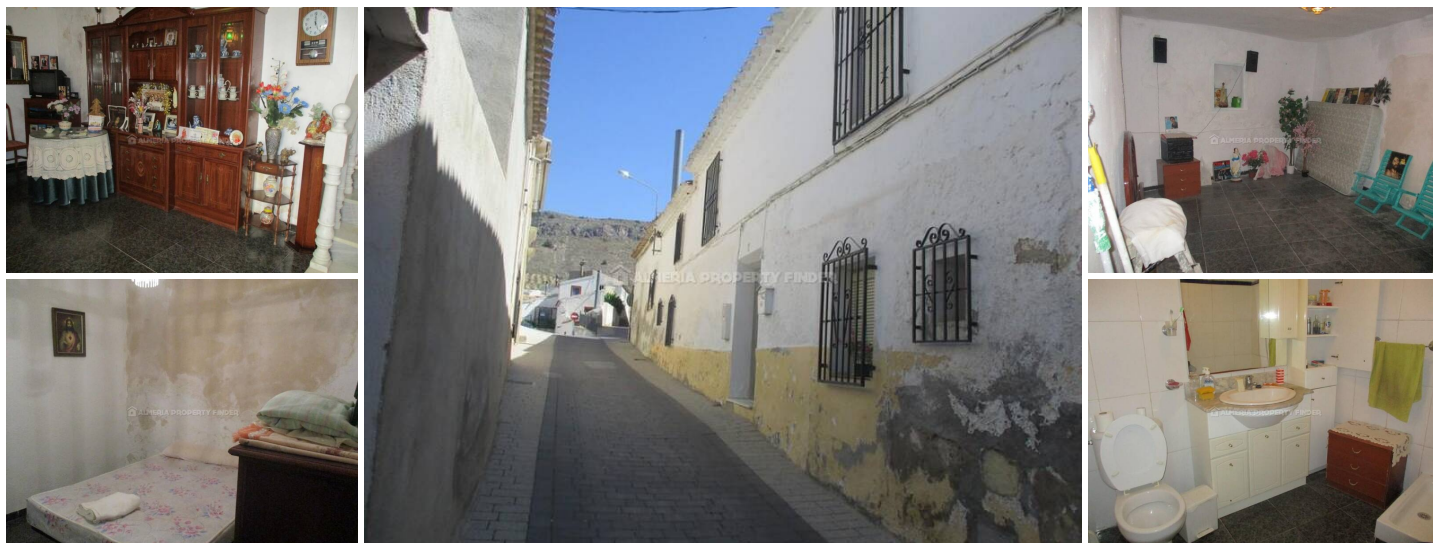
Casa Ramirez - A town house in the Oria area. (Habitable)

Terraced 3+ bedroom town house for sale in Oria, a traditional Spanish town in the Almeria Province which offers a range of amenities including tapas bars, restaurants, supermarkets, bakery, butchers, banks, medical centre, and pharmacy. There is also an outdoor municipal swimming pool which is open during the summer months, and a small market every Sunday morning. Oria is just under an hour from the coast, and around 1 hour 20 minutes from Almeria airport.