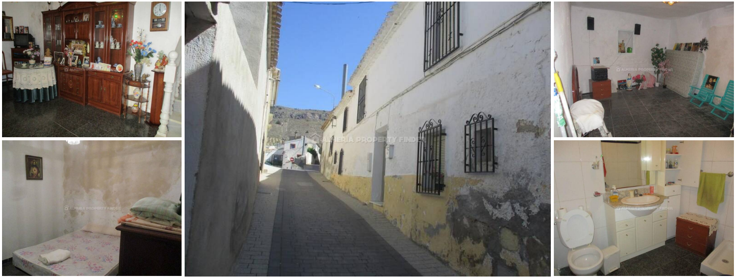
Casa Ramirez - A town house in the Oria area. (Habitable)

Terraced 3+ bedroom town house for sale in Oria, a traditional Spanish town in the Almeria Province which offers a range of amenities including tapas bars, restaurants, supermarkets, bakery, butchers, banks, medical centre, and pharmacy. There is also an outdoor municipal swimming pool which is open during the summer months, and a small market every Sunday morning. Oria is just under an hour from the coast, and around 1 hour 20 minutes from Almeria airport.