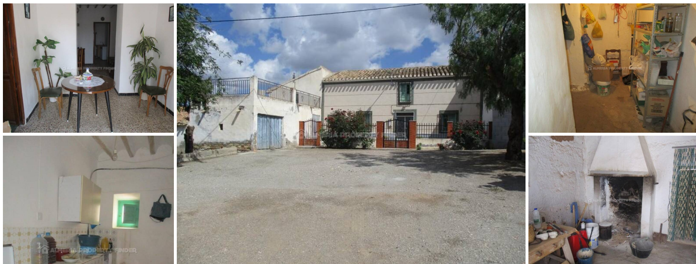
Cortijo Matias - A country house in the Oria area. (Habitable)

Habitable 4+ bedroom country property for sale in Almeria Province, situated on the Rambla de Oria around 15 minutes drive from the towns of Oria and Albox, both of which offer a wide range of amenities including shops, supermarkets, tapas bars, restaurants, schools and 24 hour medical centres.