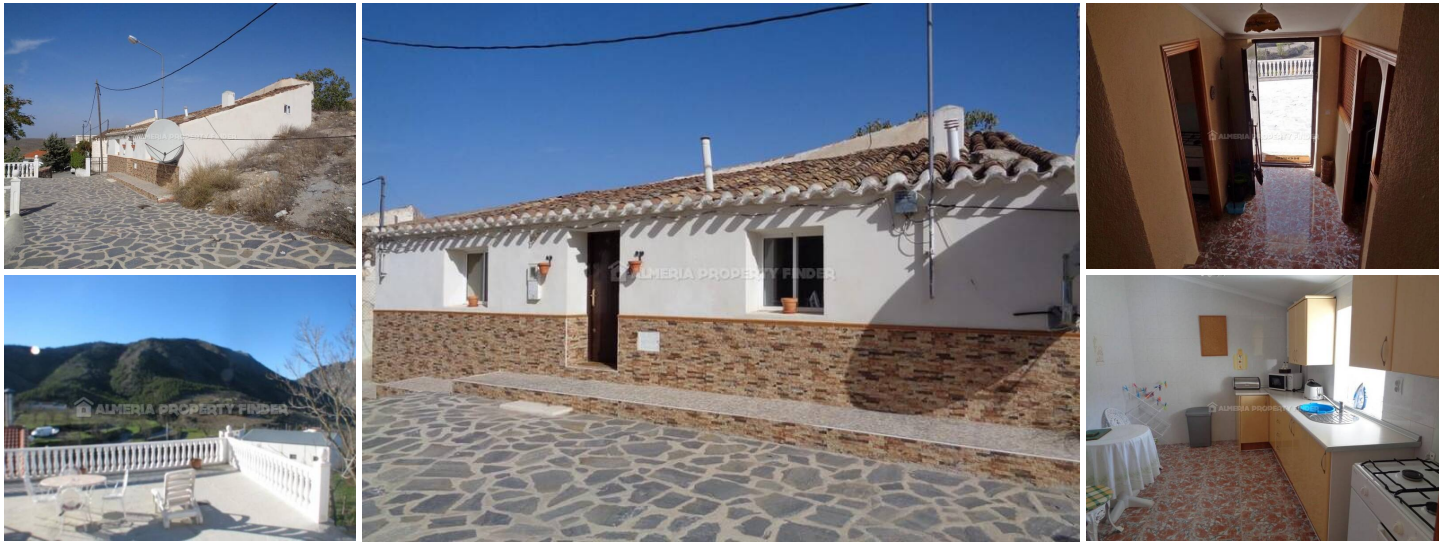
Casa Marie Dos - A village house in the Oria area. (Renovated)

Charming single storey 2 bedroom village house with stunning views, situated in the sleepy hamlet of El Margen, only 3km from a village with bars / restaurants. El Margen is situated around 15 minutes drive from the towns of Oria and Chirivel which offer all amenities.