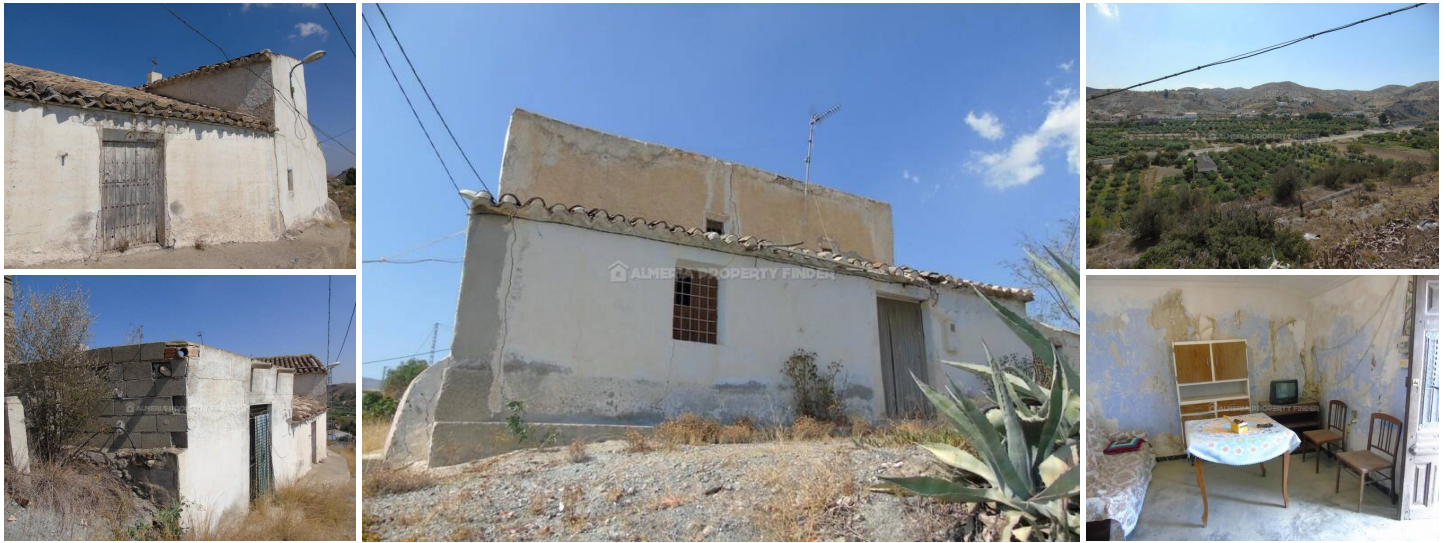
Cortijo Vanessa - A country house in the Oria area. (For Renovation)