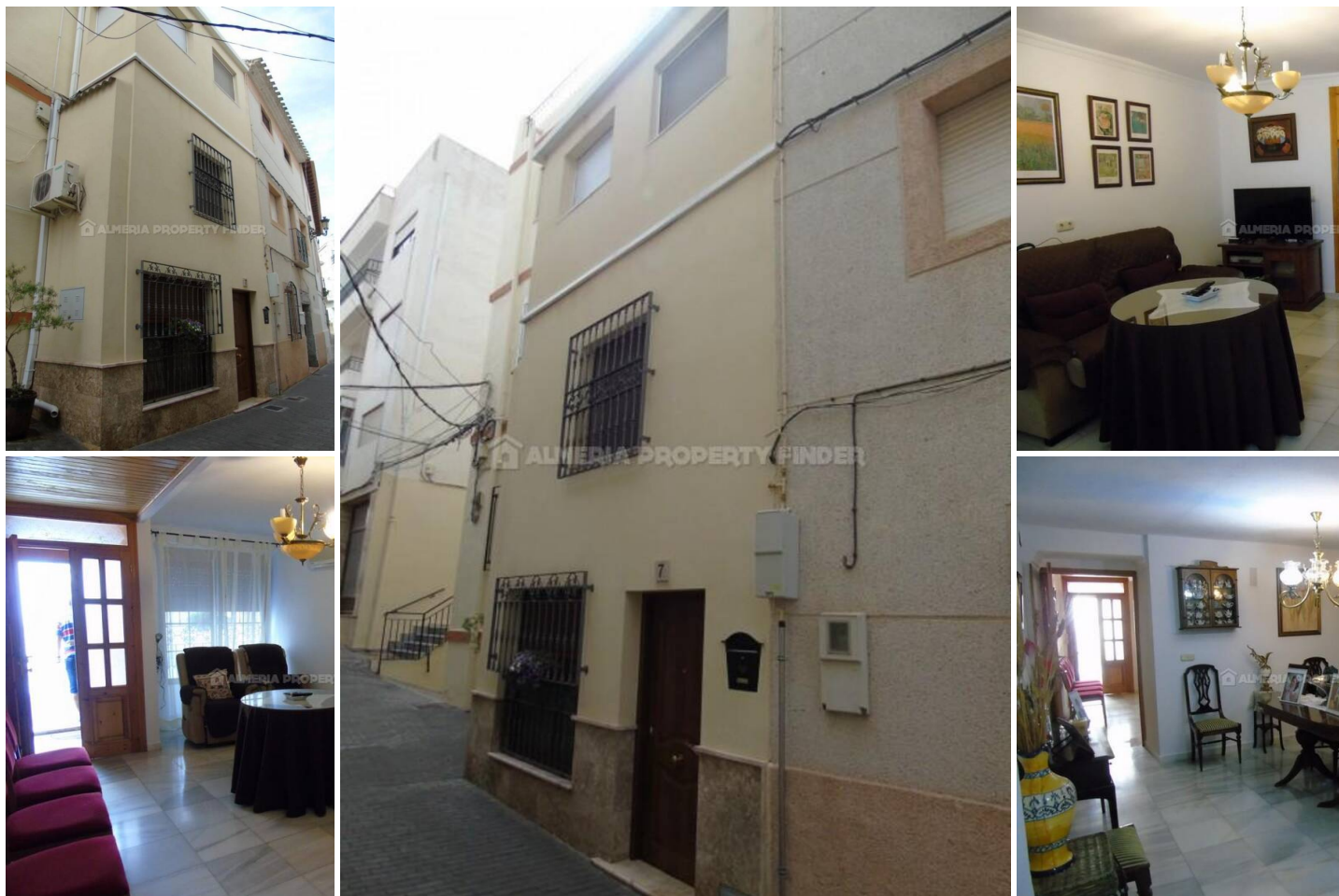
Casa Serrano - A town house in the Albox area. (Renovated)

Three storey 5 bedroom townhouse for sale in Almeria Province, situated in a tranquil street behind the main plaza in the popular market town of Albox. The town offers all amenities including a wide range of shops, supermarkets, banks, cafes, tapas bars, restaurants, schools, sports facilities, a 24 hour medical centre and two weekly markets.