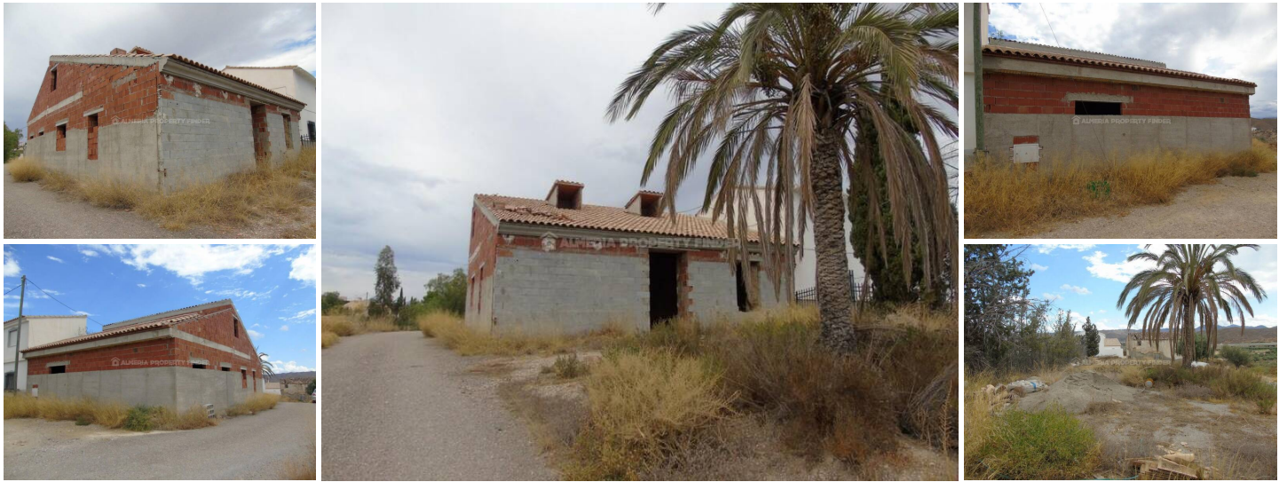
Casa Canico - A country house in the Albox area. (Under Construction)

Building project for completion: This part built semi-detached country house is in need of completion throughout including all plumbing & electrical installations, rendering and plastering, windows & doors, floors, plus the fitting of a kitchen and bathroom suite.