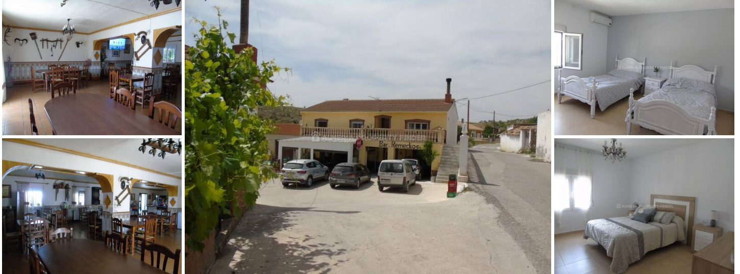
Bar Remedios - A commercial in the Oria area. (Resale)

Excellent opportunity to purchase a bar/restaurant with separate accommodation in the centre of the traditional Spanish village of Los Cerricos.