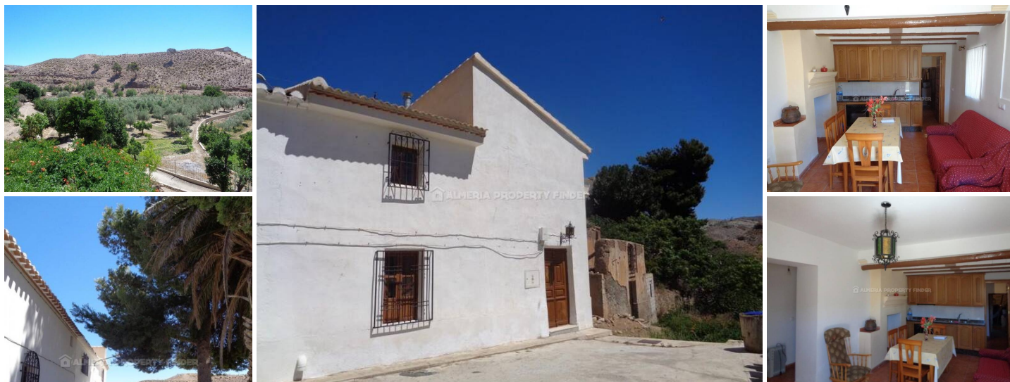
Cortijo Caparros - A country house in the Oria area. (Habitable)

Semi-detached 4+ bedroom cortijo for sale in Almeria Province, situated in the popular Rambla de Oria area. The property has been part renovated and is completely habitable, although further renovation is required to maximise the potential of this large family home.