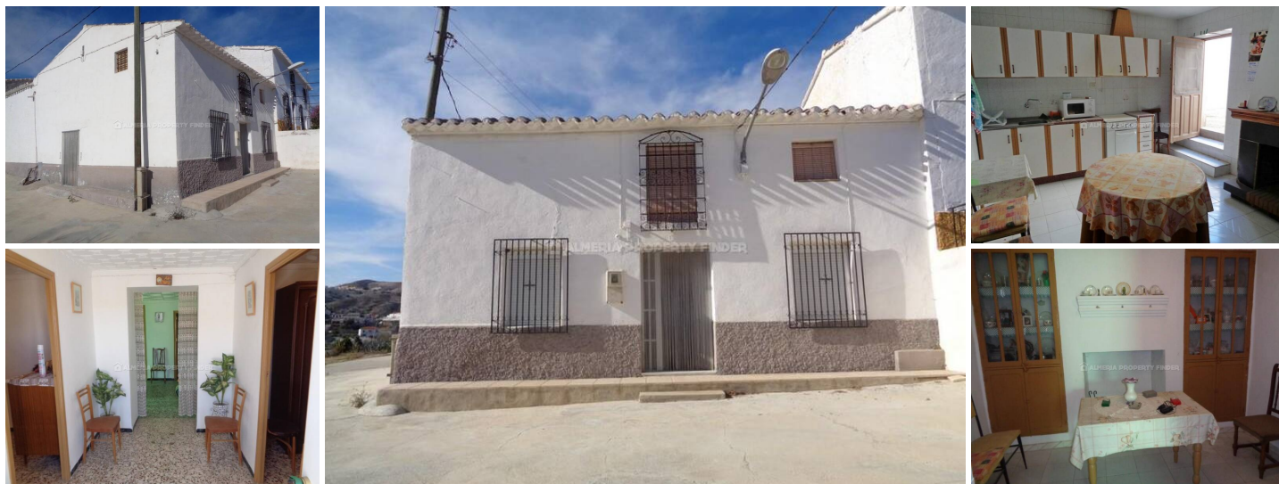
Casa Chacones - A village house in the Oria area. (Partially Reformed)

Part reformed 3+ bedroom country house for sale in Almeria, situated on the edge of a village in the Rambla de Oria.