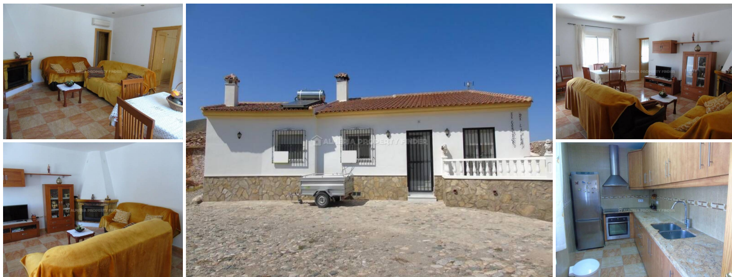
Casa de la Era - A villa in the Arboleas area. (Renovated)

Fully renovated 3 bedroom country house with large underbuild, situated around 15 minutes from the charming town of Arboleas and only 5 minutes walk from the local bar.