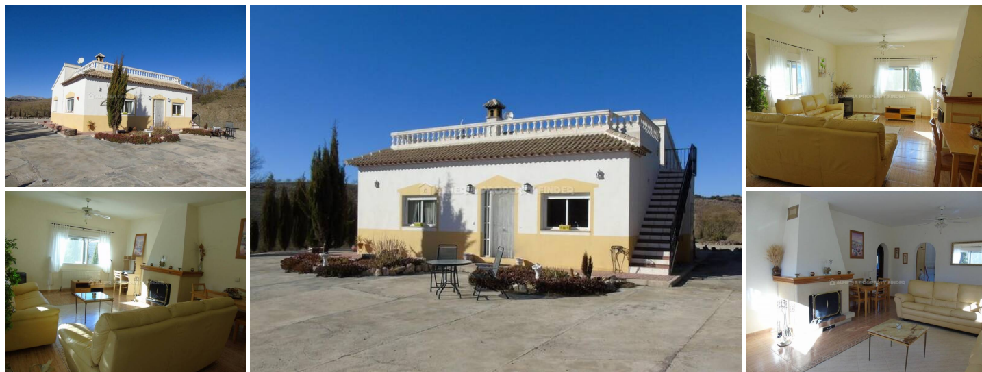
Villa Madina - A villa in the Oria area. (Resale)

Detached 3 bedroom villa in a beautiful rural setting with only two neighbours, situated just outside the sleepy hamlet of El Margen. The villa is only 3km from a village with bars / restaurants, and around 15 minutes drive from the towns of Oria and Chirivel which offer all amenities.