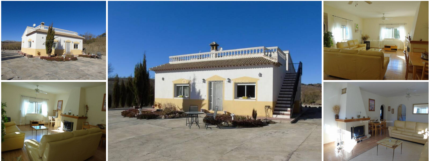
Villa Madina - A villa in the Oria area. (Resale)

Detached 3 bedroom villa in a beautiful rural setting with only two neighbours, situated just outside the sleepy hamlet of El Margen. The villa is only 3km from a village with bars / restaurants, and around 15 minutes drive from the towns of Oria and Chirivel which offer all amenities.