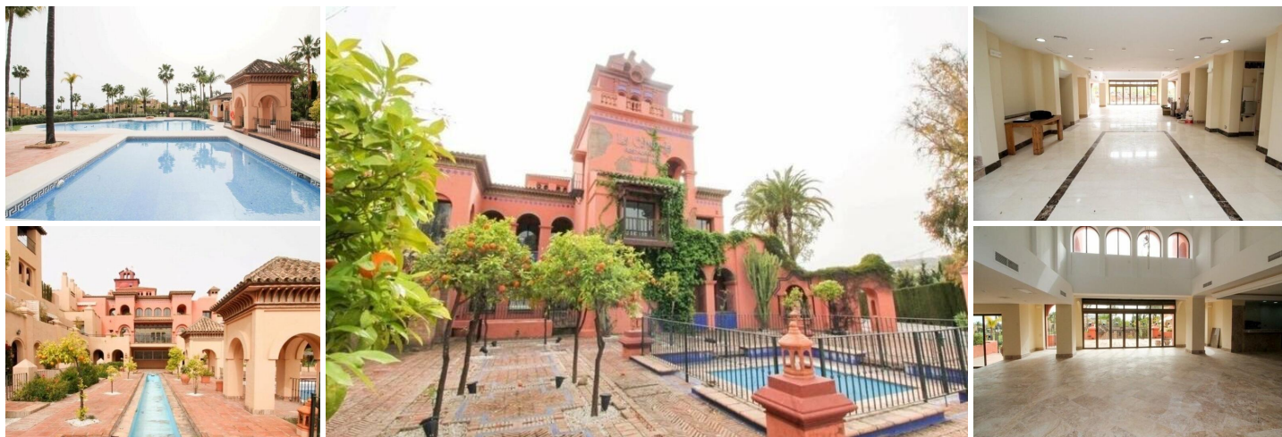
Boutique Hotel / Restaurant in La Cartuja del Golf, Atalaya.

The property originally built in 1999 is available freehold and consists of Large marbled entrance lobby with high ceilings, Restaurant area with feature fireplace and terrace for 10 tables, industrial kitchen and 14 Suites with kitchen and bathrooms, all with large terraces with golf or pool views.